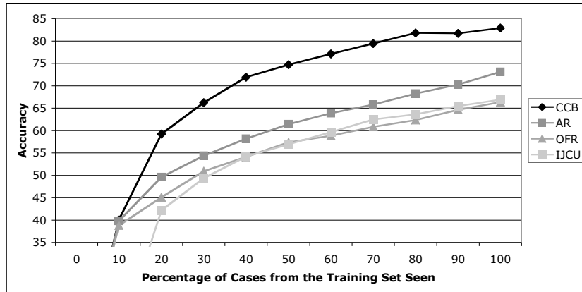
Fig. 3. Comparison of the evolution of agents' individual classification accuracy using different retention strategies.

66.88%. The increase in the committee accuracy obtained by CCB with respect to the other retention strategies is mostly due to the increase of accuracy of the individual CBR agents, from 73.11% to 82.88%. Moreover, the increase from the individual accuracy to the committee accuracy is due to the ensemble effect, from 82.88% to 91.5% with the CCB strategy. Notice that the ensemble effect requires that the errors made by the individual agents are not correlated. Therefore, we can conclude that the CCB strategy is able to keep the error correlation among the agents low so that they can still benefit from the ensemble effect.